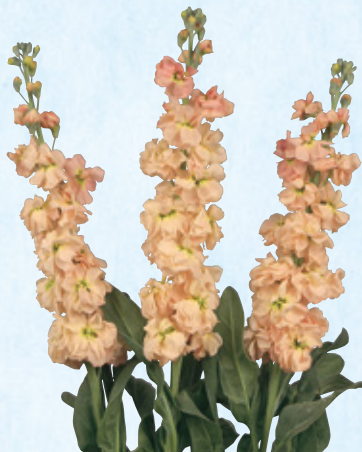
101402 Asa no Mai (apricot)