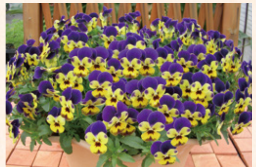
841001 Ai Citrine