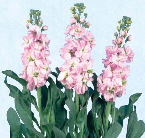
101508 Sakura no Uta (light cherry)