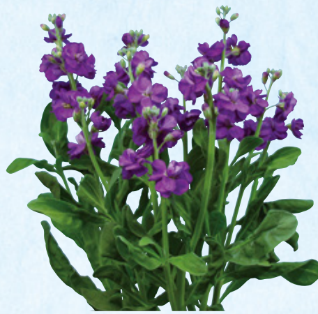
102002 Chanter Blue