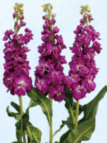
101201 New Kabuki Dark Lavender