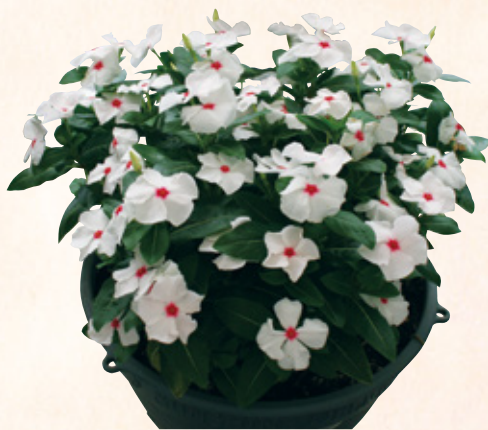
820007 Jaio Peppermint