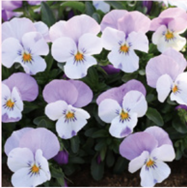
NEW Viola Millionflora Pink Cap <Page 29>