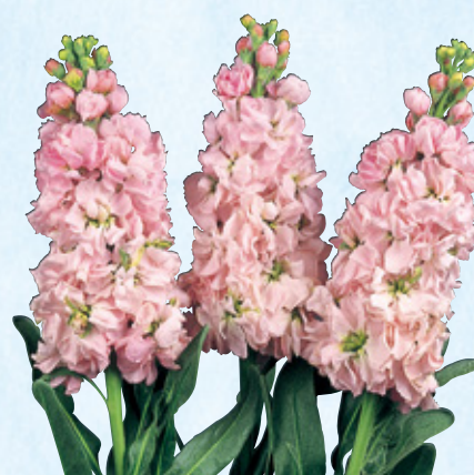
101305 Sakura no Kagayaki (light pink)