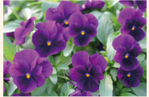
830012 Millionflora Deep Purple