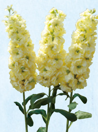
101208 New Kabuki Yellow