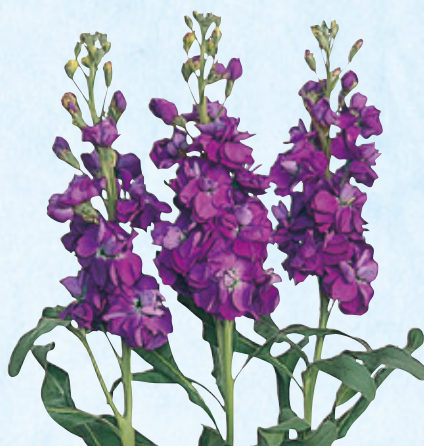
101411 Murasaki no Mai (purple)

Mai Series featured the fastest-grow lines. Plants produce large flowers and dense spikes in uniform with thick and height of 80-90 cm (32-36 in.). Manageable to gain high yield and return with consistency of timing and habit.