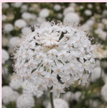
NEW Blue Lace Flower Sandpiper <Page 4>