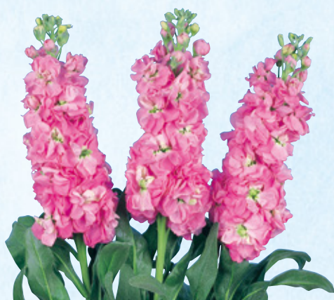
101304 Haru no Kagayaki (rose)