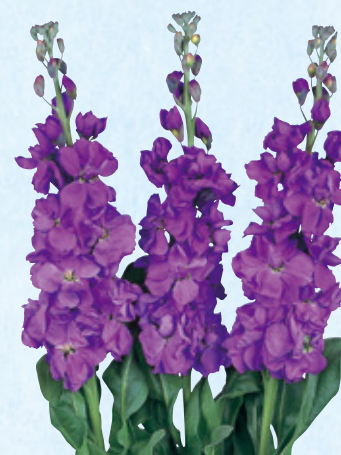
101407 Nami no Mai (blue)