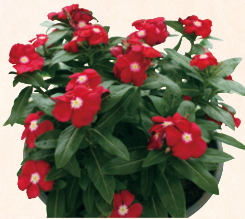
820001 Jaio Bicolor Deep Rose

Cheer it up! Named as a Chinese word of 'add oil' or 'cheer it up'. The eye-catching large flowers on the mound shaped plant will greatly cheer up your garden. Easy to grow and establish naturally branching