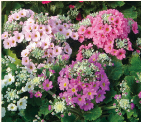
801052 New Fuji Formula Mixture