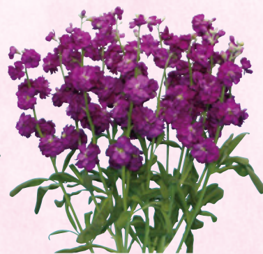
NEW Stock Chanter Purple <Page 21>