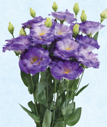
202205 Crown Azure Large flower featured deep flashing blue. Well branched plant with thick petals works for good yield.