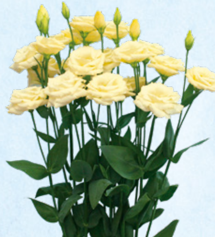
202204 Crown Yellow An attractive yellow flower variety. Slightly shorter in the series but eye-catching enough. Recommendable for natural cropping schedule.