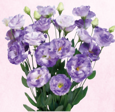
NEW Eustoma Acoustic Blue Sounds <Page 7>