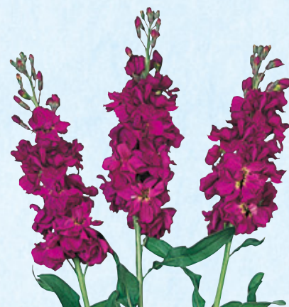
101103 Beauty Wine Red