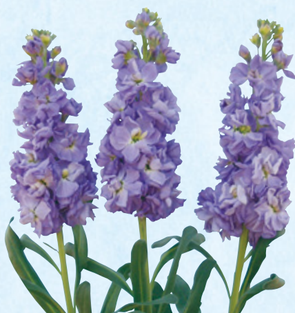
101505 Kaze no Uta (light blue)