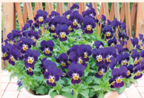
841004 Ai Sapphire