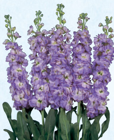
101404 Kaze no Mai (light blue)