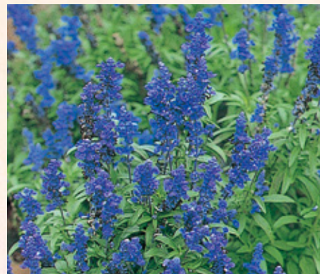
850005 Signum Blue

Traditional blue and white farinaceas are usable choice with the compact habit for container and popular bedding item. Plants grow at 40cm (16 in.) more or less in well uniform.