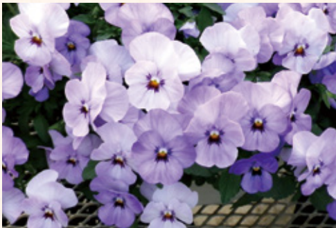
830014 Millionflora Lilac