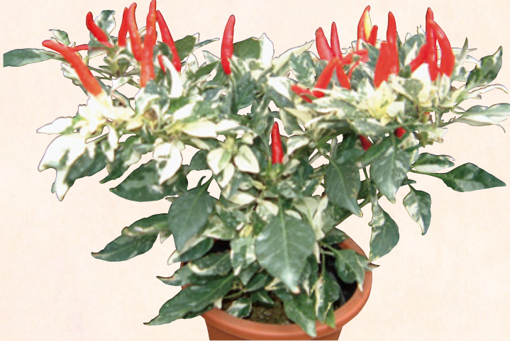
850001 White to Red

Dwarf and variegated pepper for ornamental purpose. Works for either of indoor and outdoor pots, or containers. The fruits start off white then mature to bright red. 30 to 40 fruits can be seen at the same time. Holds fruits well with excellent shelf-life. White to Red is a HOT pepper. Please DO NOT touch the fruits, or carefully with glove when touch the plant.