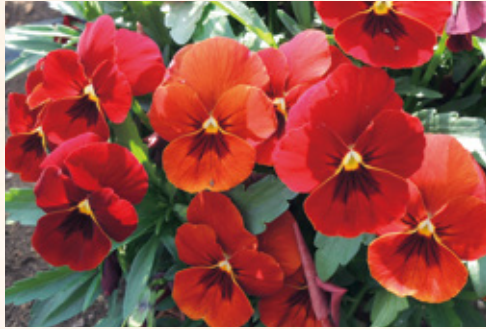
830005 Millionflora Blaze Blotch