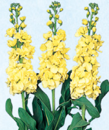
101506 Ki no Uta (deep yellow)