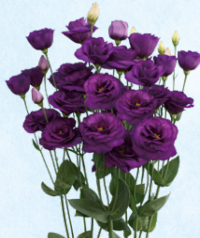
202201 Crown Blue Rose shaped fully double flowers keep purple blue less faded. Recommend shading under strong sun light. Slightly shorter in the series.