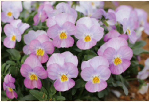
830016 Millionflora Peach Tart