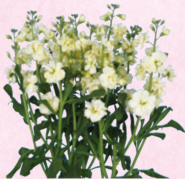
NEW Stock Chanter AD Yellow <Page 21>