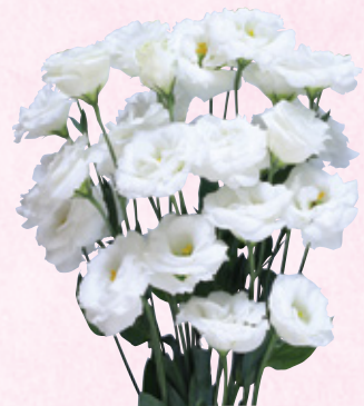
NEW Eustoma Daylight Reflexion <Page 7>