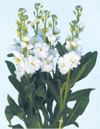
102007 Chanter Pure White