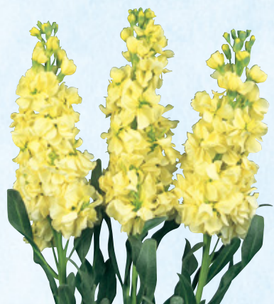
101306 Tsuki no Kagayaki (deep yellow)