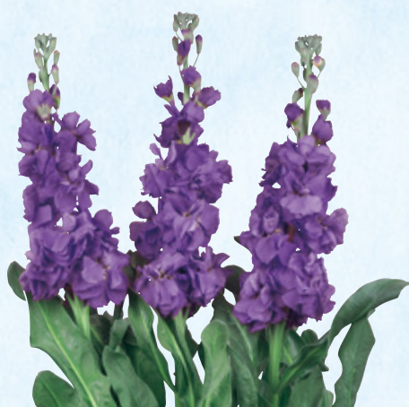
101401 Ao no Mai (purplish blue)