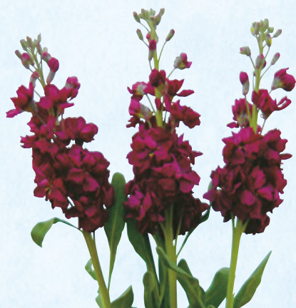
101101 Beauty Reddish Purple

Specially focused on unique bold colors. Early blooming on strong and well-balanced stems with excellent uniform habit.