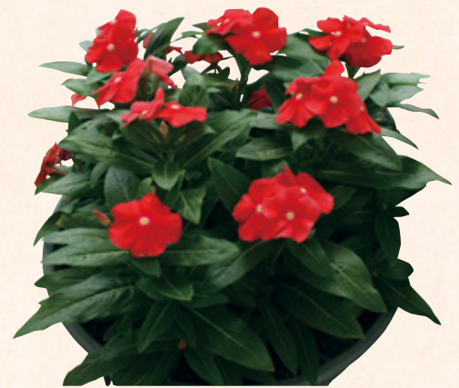
820002 Jaio Cherry Red