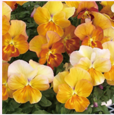
NEW Pansy Waraku Tangerine Sky <Page 26>