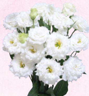
NEW Eustoma Snow Under <Page 7>