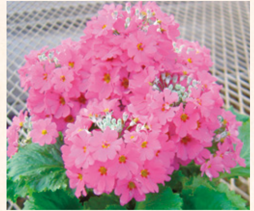
801003 New Fuji Cherry Pink