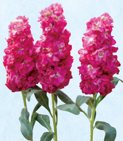
101206 New Kabuki Red