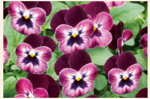
830009 Millionflora Wine Flash