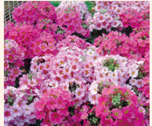
801051 New Fuji Bicolor Mixture