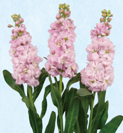
101204 New Kabuki Light Pink