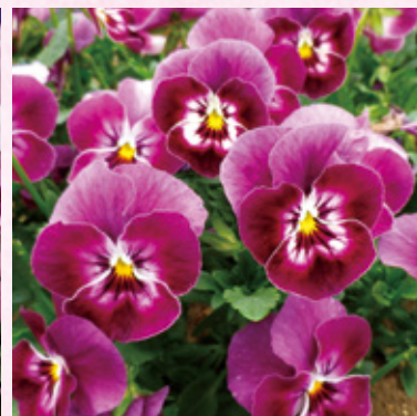
NEW Pansy Waraku Strawberry <Page 26>