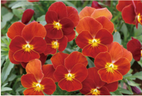
830018 Millionflora Scarlet