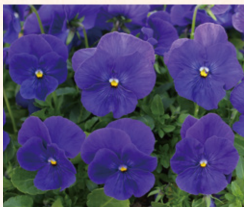
840012 Waraku True Blue