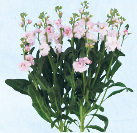
102003 Chanter Cherry