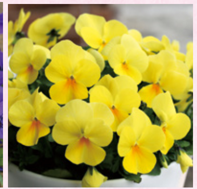
NEW Viola Millionflora Primrose <Page 29>