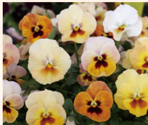
840011 Waraku Apricot Tea