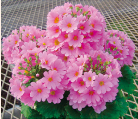
801004 New Fuji Dark Cherry