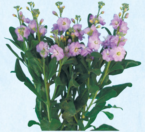
102005 Chanter Lavender