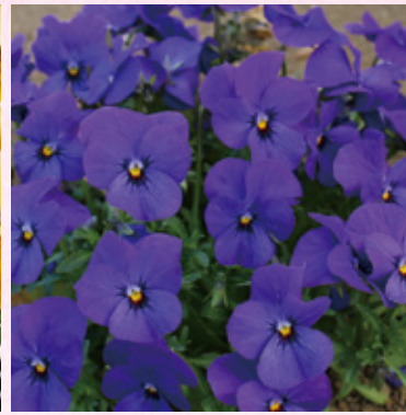
NEW Viola Millionflora True Blue <Page 29>