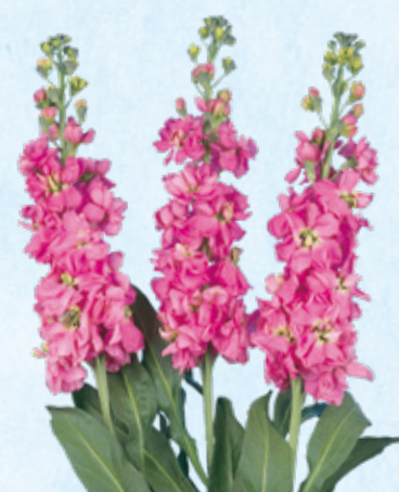
101403 Haru no Mai (rose)