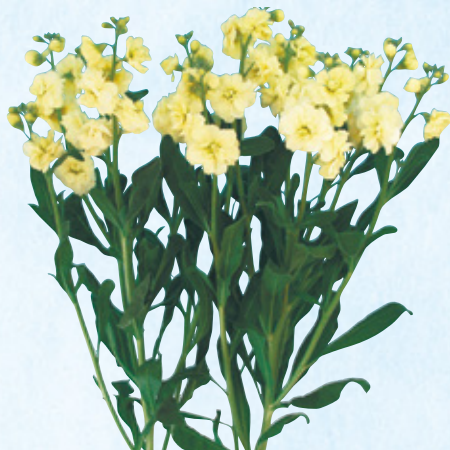
102010 Chanter Yellow