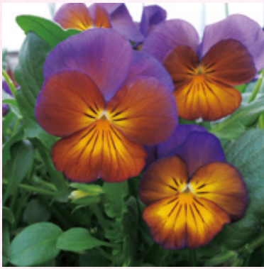
NEW Pansy Waraku Midnight Moon <Page 26>