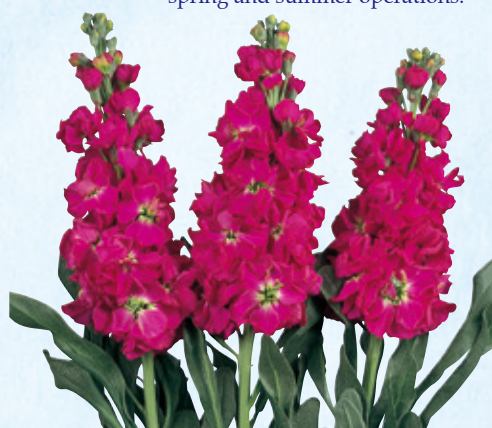
101302 Beni no Kagayaki (red)

Late flowering series with excellent spike form and hard stem. Later than Mai and Uta, but plants take enough time to produce rich stems heading to early spring. A cool-conditioned period required to flower, so that no recommendation for late spring and summer operations.