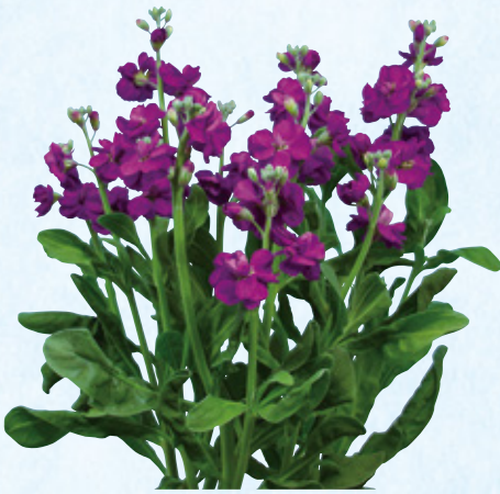
102004 Chanter Grape