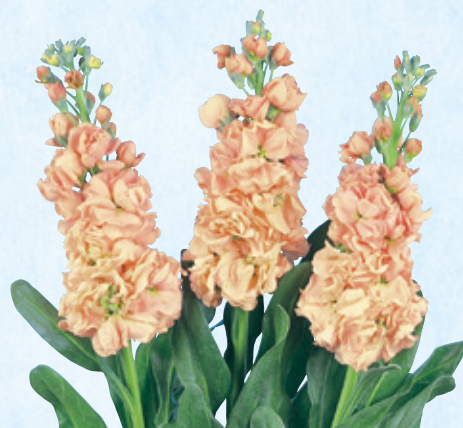
101301 Asa no Kagayaki (apricot)