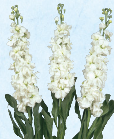
101409 Yuki no Mai (pure white)