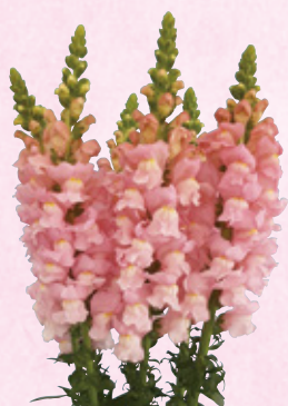
NEW Snapdragon Memorial Cherry Pink <Page 22>