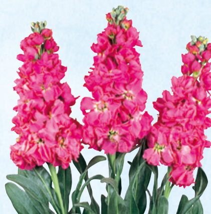
101303 Hana no Kagayaki (rose red)