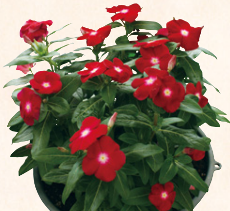
820003 Jaio Dark Red