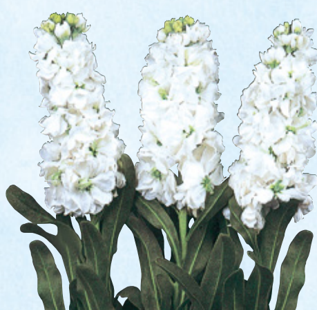
101510 Yuki no Uta (white)