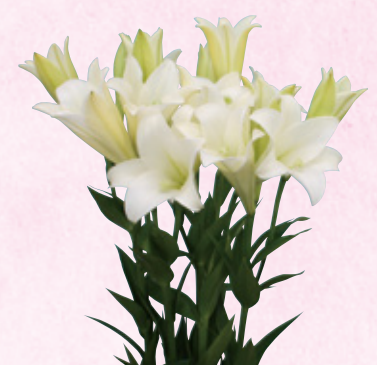
NEW Lilium Linca EX No. 3 <Page 14>