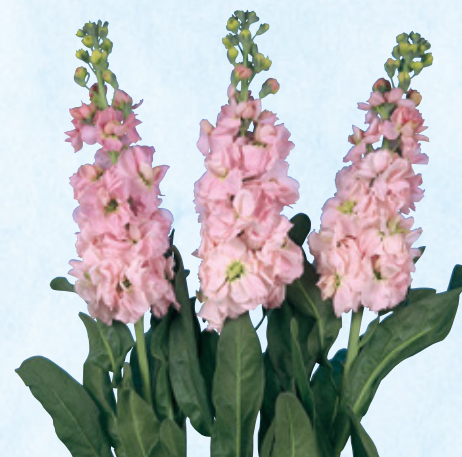
101408 Sakura no Mai (light pink)