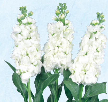
101307 Yuki no Kagayaki (white)