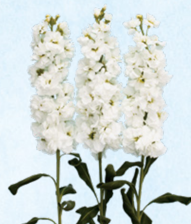
101207 New Kabuki White