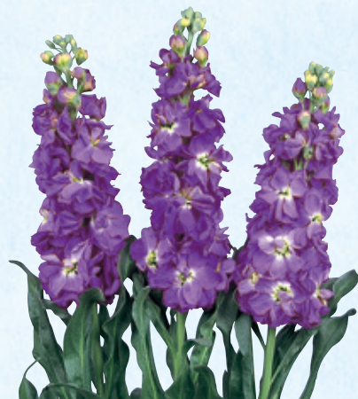
101501 Ao no Uta (purplish blue)