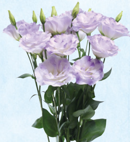
202206 Crown Blue Flash Misty blue tone blooms on well balanced and structured plants. Hard stem variety with middle height. Good stem numbers are available in average timing of the series.

Medium-large fully double varieties, mid to late flowering, are assorted. Good branching habit designed for natural to autumn crop.