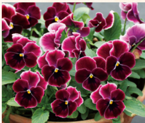
840015 Waraku Rose Eclipse