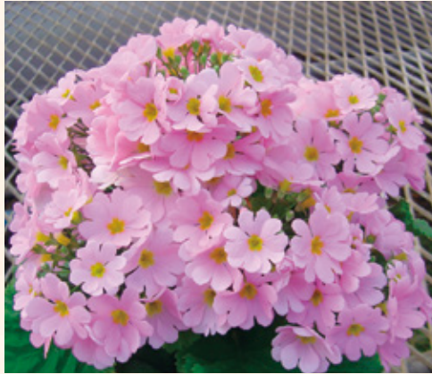
801002 New Fuji Cherry