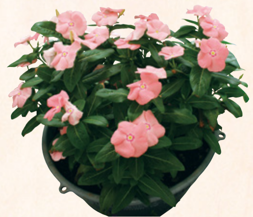
820008 Jaio Salmon Pink