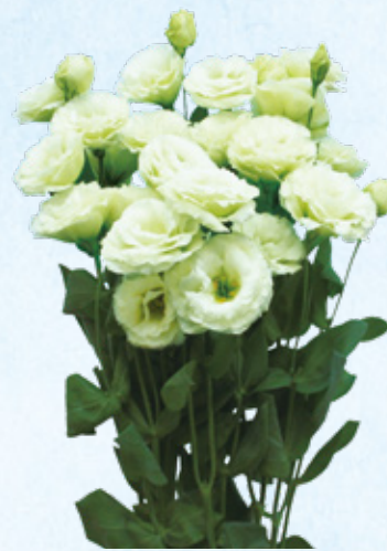
202102 Ceremony Green Large flower and the most vigorous in the series. Rich double flowers with fresh green on long stems.