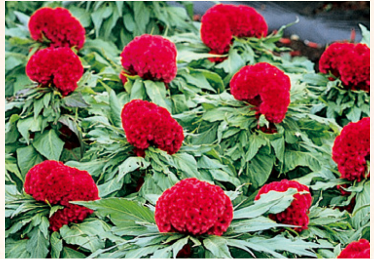
511301 Orient No.2

Unique ball-shaped bright red celosia displays the summer garden. The heads become 13 to 16cm (5 to 7 in.) across on 30 to 35cm (12 to 14 in.) height.