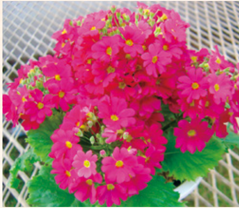
801005 New Fuji Deep Red

Fuji Series, a long running primula malacoides, improved under the name of NEW Fuji with larger flower, more layered-branching and evenly earlier to flower.