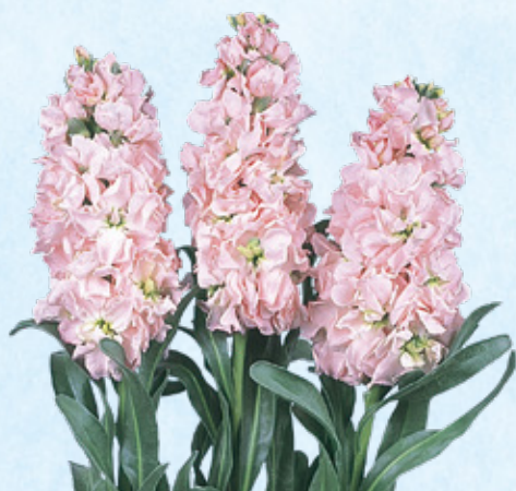
101511 Yume no Uta (light pink)