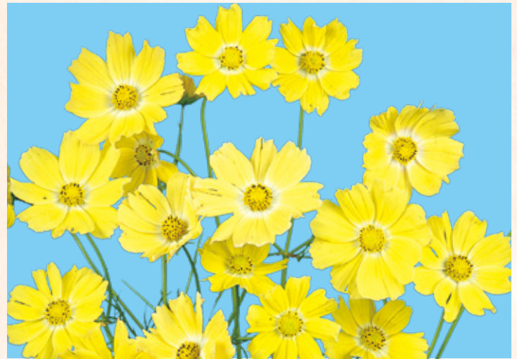
502027 Yellow Garden

Bright yellow with creamy-lemon eye. Sow in January to early February and start to flower in May. As natural cropping, flower opens 80 to 90 days after sowing in summer garden.