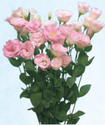
202110 Ceremony Pink Flash A variety with strong stems, hard neck and nicely thick petals.