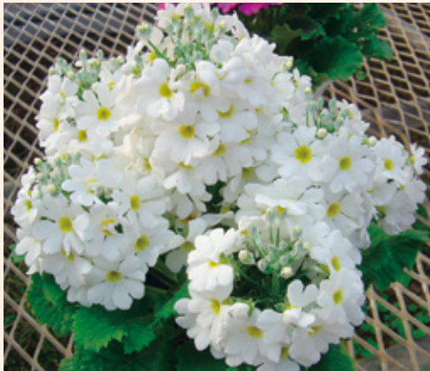
801010 New Fuji White