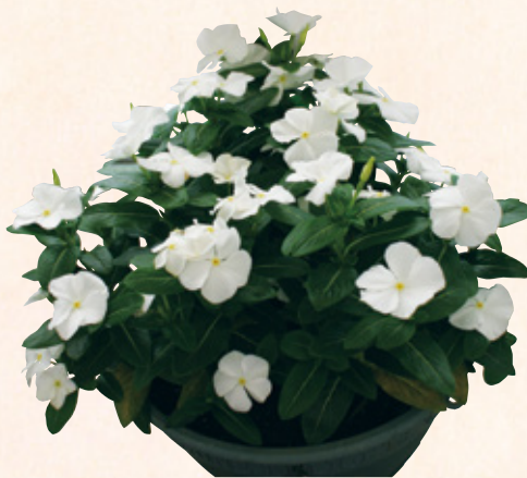
820014 Jaio White