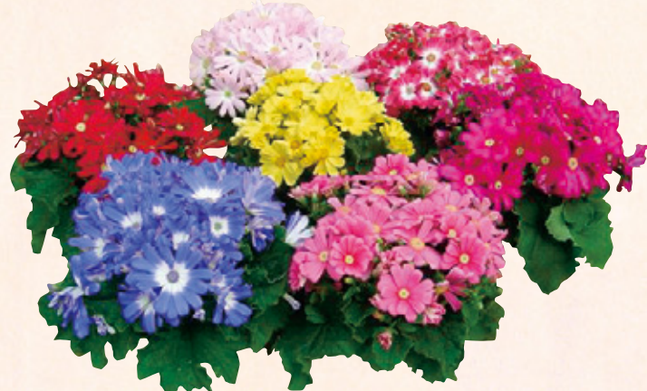
810051 Resort Mixture

Resort Series Carefully selected mixture with bigger flowers on compact plants with smaller dark green leaves and great uniformity from sowing to flower timing.