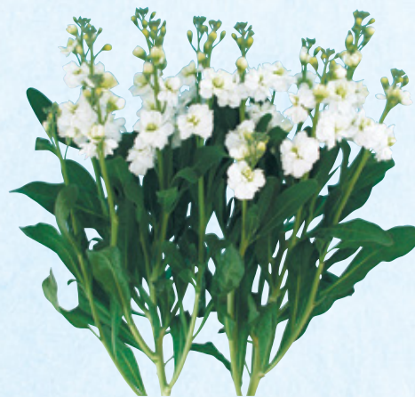
102009 Chanter White