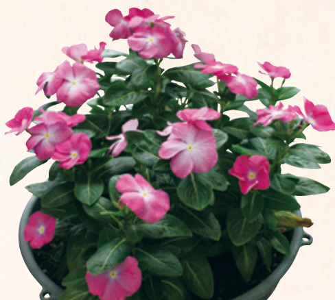
820011 Jaio Sky Blue