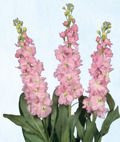
101406 Koi no Mai (deep pink)