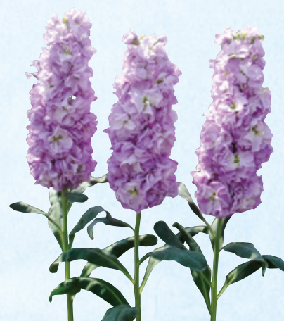
101203 New Kabuki Lavender