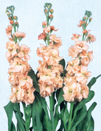
101502 Asa no Uta (apricot)