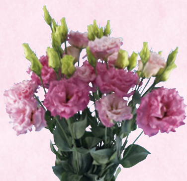
NEW Eustoma Luminex Baby Pink <Page 9>