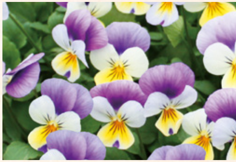
830006 Millionflora Twilight