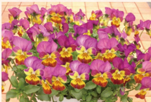
841002 Ai Coral

Great-performing spreading viola Ai Series produces more basal-stem potentials and grows up to 60 cm (25 in.) across keeping natural mound shape. Perfect for large container, hanging and patio garden, as flowering without open spot in the center.