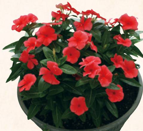
820012 Jaio Vermillion