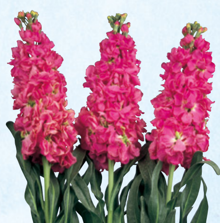
101504 Hana no Uta (rose red)