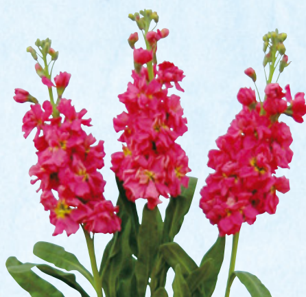
101102 Beauty Salmon Pink