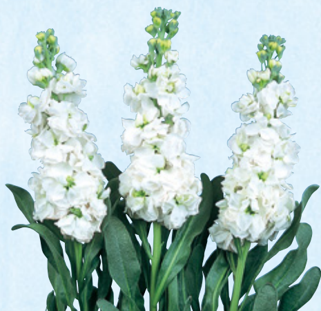
101509 Shinju no Uta (pearl white)