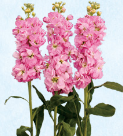
101205 New Kabuki Pink