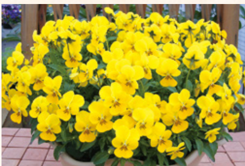
841003 Ai Marigarnet