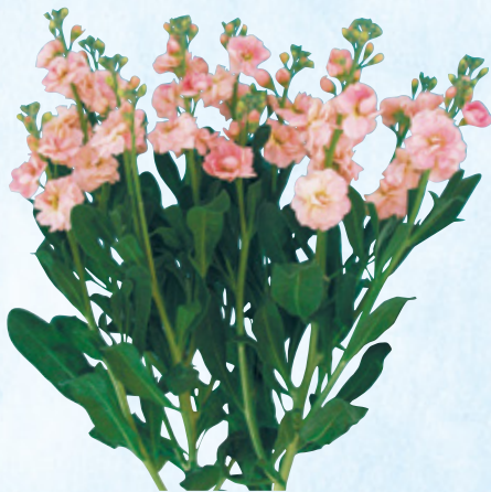
102001 Chanter Apricot