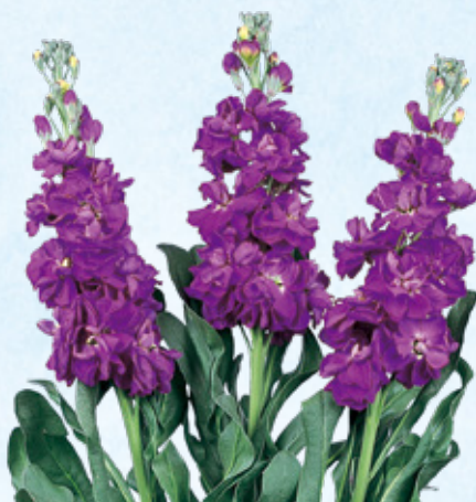
101507 Murasaki no Uta (purple)

In-between timing of Mai and Kagayaki. Featuring large spike and thick stem with very wide colors as well as Mai Series. Slightly taller in height; 90-100cm (35-40 in.).