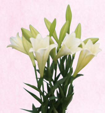
NEW Lilium Linca EX <Page 14>