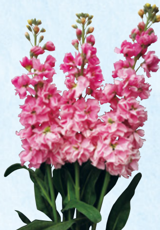
101209 New Kabuki Rose Pink