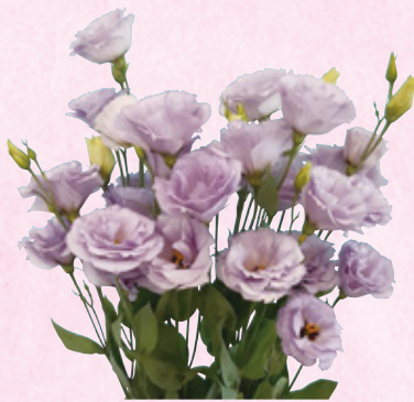
NEW Eustoma GX Lavender <Page 7>