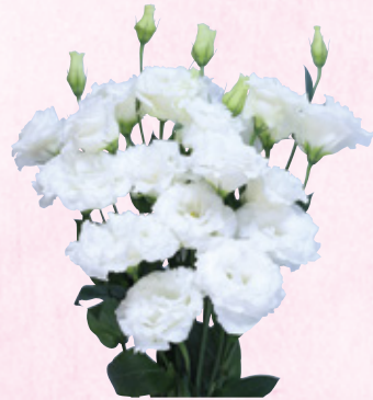
NEW Eustoma Circling White <Page 7>