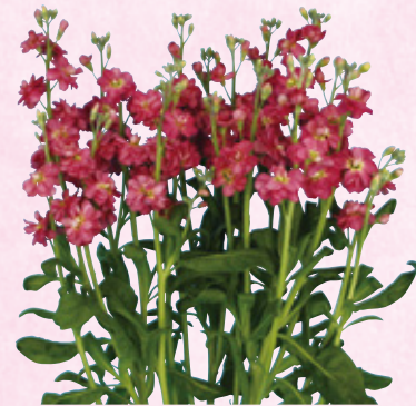
NEW Stock Chanter Antique Rose <Page 21>