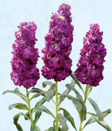
101202 New Kabuki Dark Purple

Improved over former Kabuki Series in terms of wider color choices with large florets, long ideal dense spikes and dark green foliage. One of the fastest series.