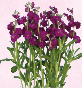
NEW Stock Chanter Bordeaux <Page 21>