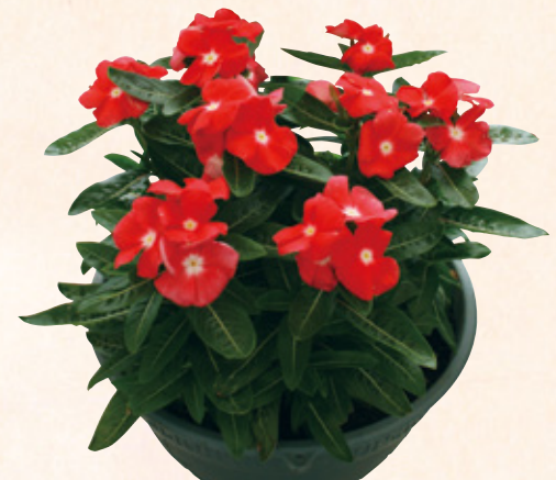
820013 Jaio Vermillion Eye