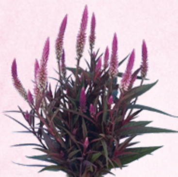
NEW Celosia Brick Arch <Page 4>