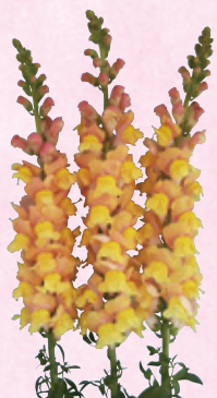
NEW Snapdragon Smile Bronze <Page 22>