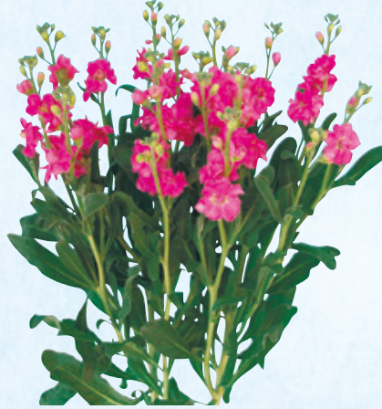
102006 Chanter Pink