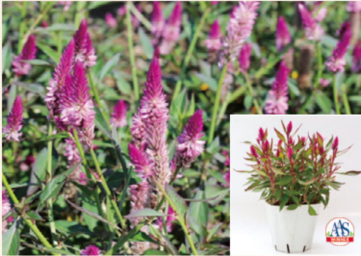
511101 Asian Garden

Ideal to decorate your garden from spring till frost. Keeps flowering with intensive rose pink tassels that attract bees and butterflies. Wind-hardy, heat and disease tolerant variety.