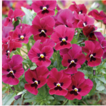
NEW Viola Millionflora Rose Blotch <Page 29>