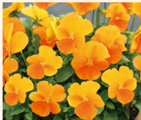
840003 Waraku Clear Orange