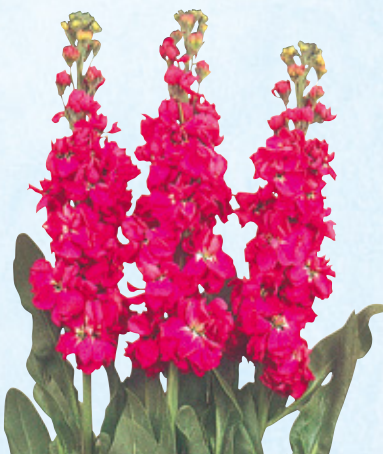
101503 Beni no Uta (red)