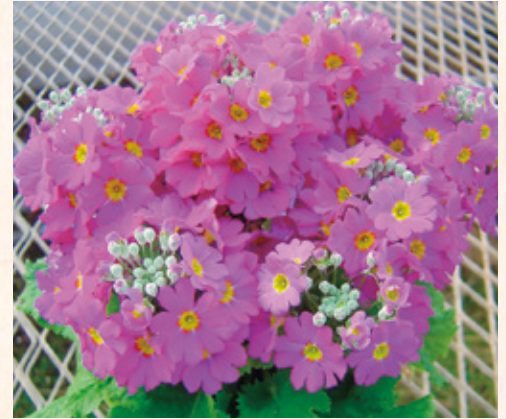
801001 New Fuji Blue