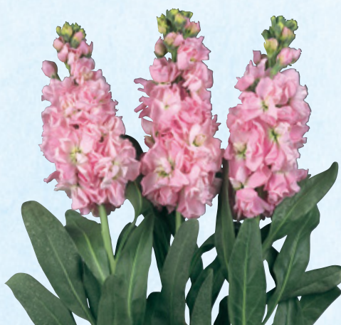
101410 Yume no Mai (pink)