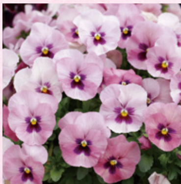
NEW Pansy Waraku Pink Blotch <Page 26>