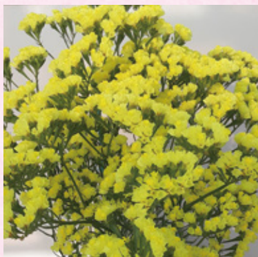
NEW Limonium Sunny Showers <Page 13>