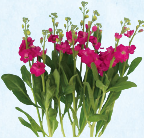
102008 Chanter Red