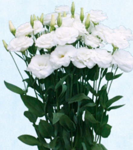
202203 Crown Snow Stays fully double under high temperature condition. Good branching and massive plants. Light greenish white may appear in very small percentage.