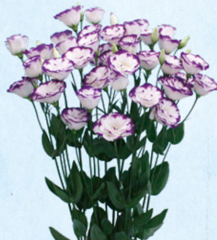
202202 Crown Blue Sounds Blue rim accented. For autumn crop, a greenhouse shade helps to harvest enough long stems during summer.