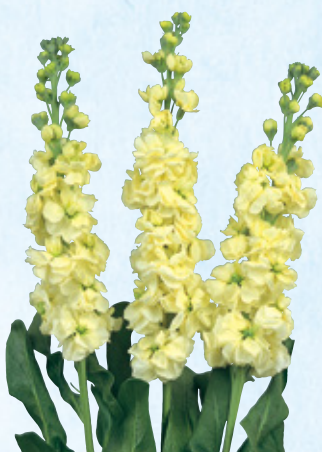
101405 Ki no Mai (deep yellow)