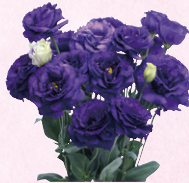
NEW Eustoma Circling Blue <Page 7>